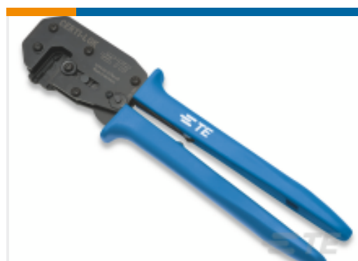
TE Part # 169400 CERTI-LOK FRAME W/O DIES