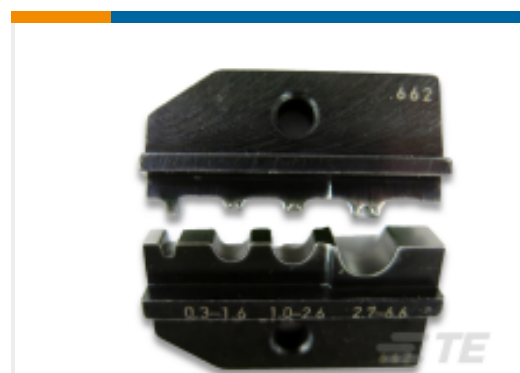
TE Part # 539662-2 MATR SOLISTR 0,3-6,